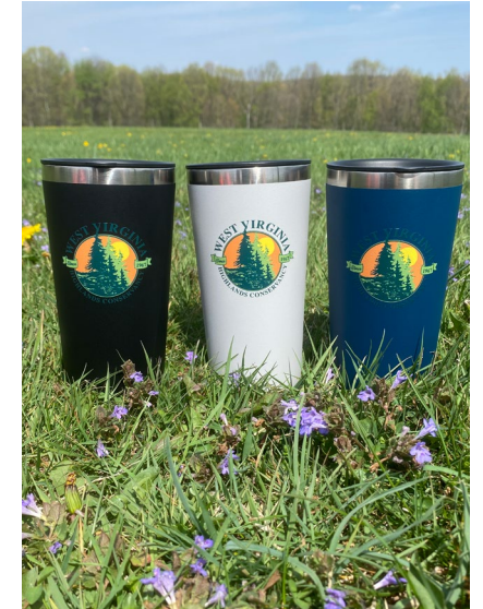
21 oz. Standard Mouth Flex Cap Water Bottle