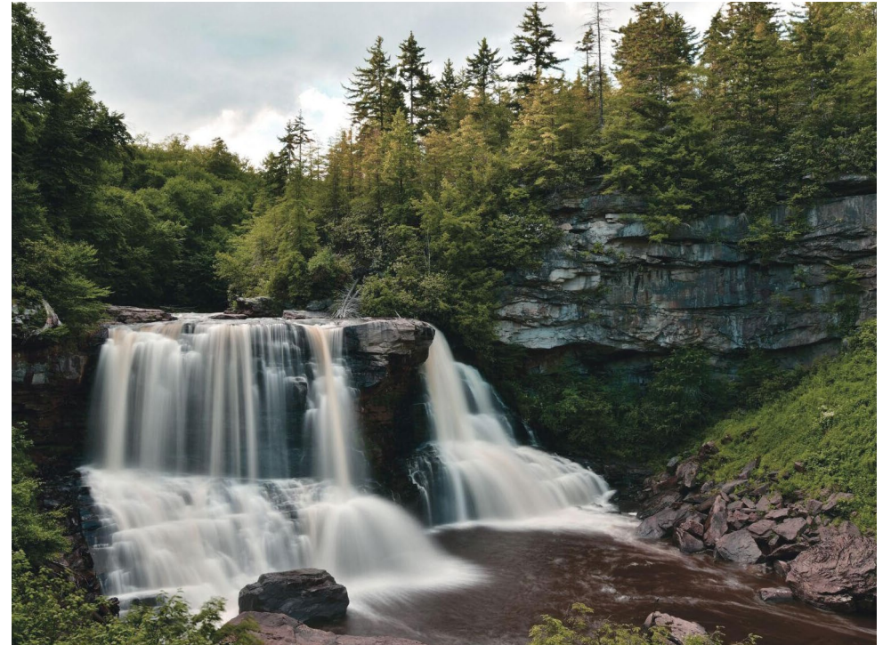
Blackwater Falls

Loopemount Waterfall -- Located near mile marker 8.1 on the 78-mile Greenbrier River Trail, the