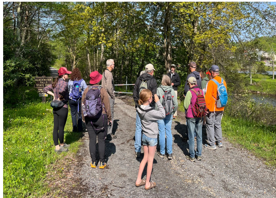
A group of members and supporters gathered at Blackwater Falls State Park for the first birding outing of the year.