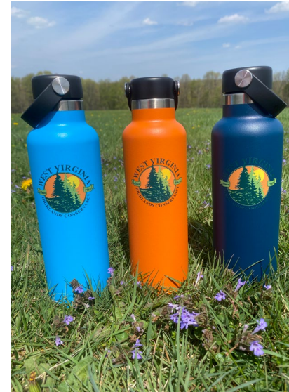
21 oz. Standard Mouth Flex Cap Water Bottle

A range of new items are now available for purchase in the West Virginia Highlands Conservancy online store at wvhighlands.org , including four different colors of 100% organic cotton t-shirts and two different types of Conservancy-branded HydroFlasks! We can't wait to see you sporting the new gear! Be sure to take photos and tag us on social media.